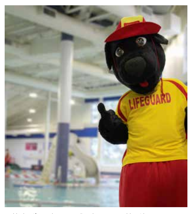
Buddy the Lifeguard Dog attending the YMCA Healthy Kids Day

The Society also partnered with the Canadian Safe Boating Council to send several seasonal co-branded media releases to promote safe boating behaviour as well as share social media posts.