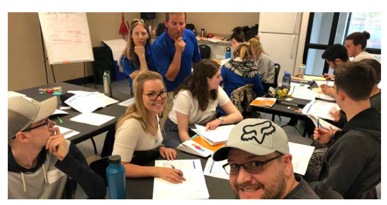
Trainer Course in St. Albert

Three (3) new affiliates join the Swim for Life family by offering the Lifesaving Society's learn to swim program in their community. All affiliate delivery partners delivering the Swim for Life program were sent hanging wall banners. The Society was pleased to be able to present many of these banners to affiliates in person and celebrate the success of the Swim for Life program.