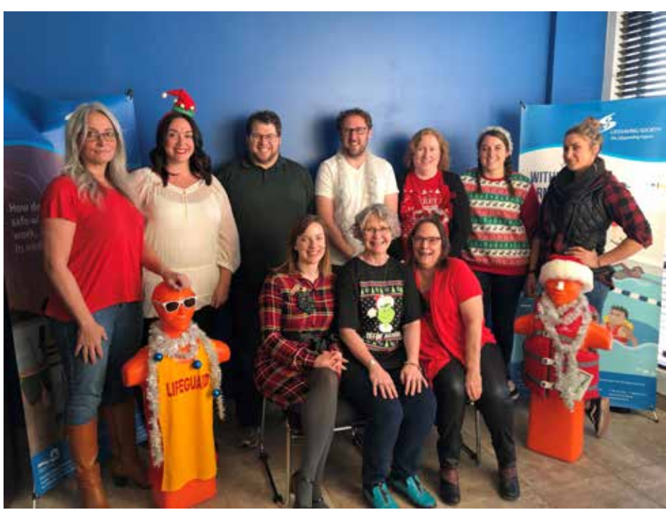
Lifesaving Society Staff, Christmas 2018