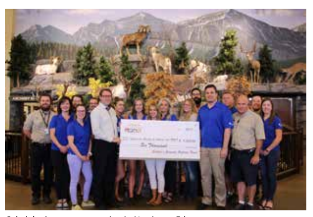
Cabela's cheque presentation in Northeast Edmonton

the Governments of Alberta and the Northwest Territories and volunteers across Alberta and the Northwest Territories for their continued support of this valuable program. The Society has maintained a partnership with Cross Country Parts Distributors who provide lifejackets at cost for our Lifejacket Loaner Stations. The Society provides banners for the Lifejacket Loaner Station program, which can be customized, as well as posters and maps for all of the Lifejacket Loaner Stations. The Society also provides Water Smart rack cards to all of the Lifejacket Loaner Stations.