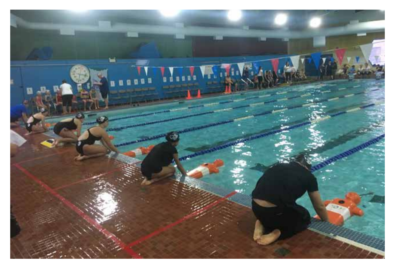
Hinton - Sanctioned Competition, November 2018

The 2018 Canadian Surf Lifesaving Championships were held on August 24-26, 2018 at Centre touristique du Lac-Simon, Duhamel, Quebec.