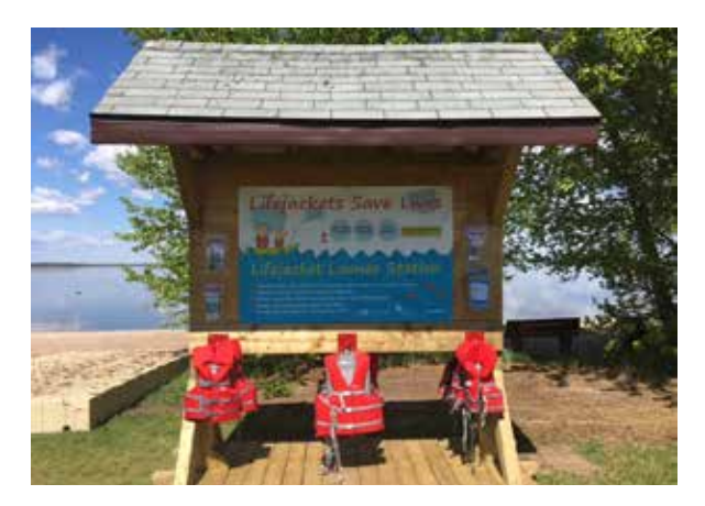
New Lifejacket Loaner Station in Lac La Biche

absent or distracted supervision. Consistent with previous years, males contributed to the vast majority of drownings. The age groups with the highest risk for drowning include children 0-4 years of age, young adults 20-34 years of age and seniors over the age of 65. The highest rates of drownings occurred between the months of May and September and in natural bodies of water such as lakes and rivers.