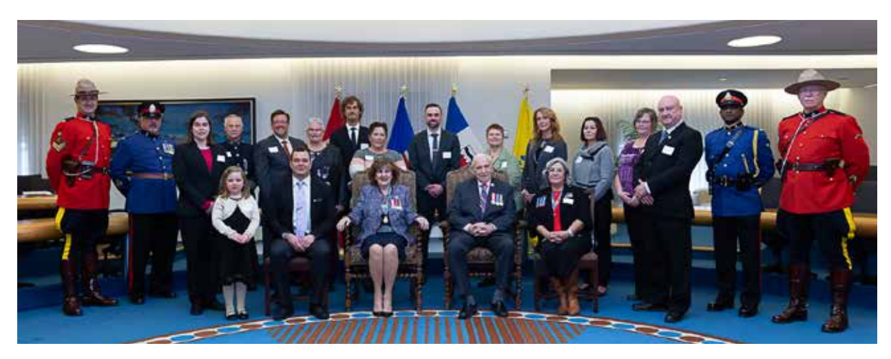
2018 Annual Investiture of Lifesaving Honours