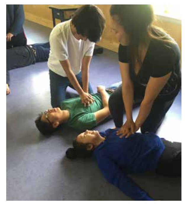
Emergency First Aid Training in Lutselk'e, Northwest Territories