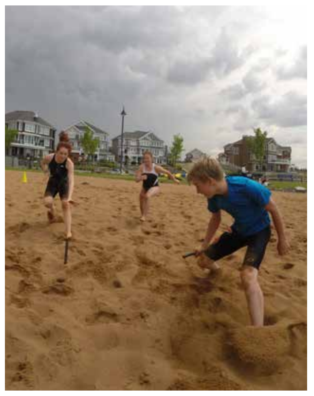
2018 Lifesaving Sport Camps

<sup>®</sup>Lifesaving Society, Water Smart, Swim to Survive, Swim for Life and National Lifeguard Service are all registered trademarks of the Royal Life Saving Society Canada.