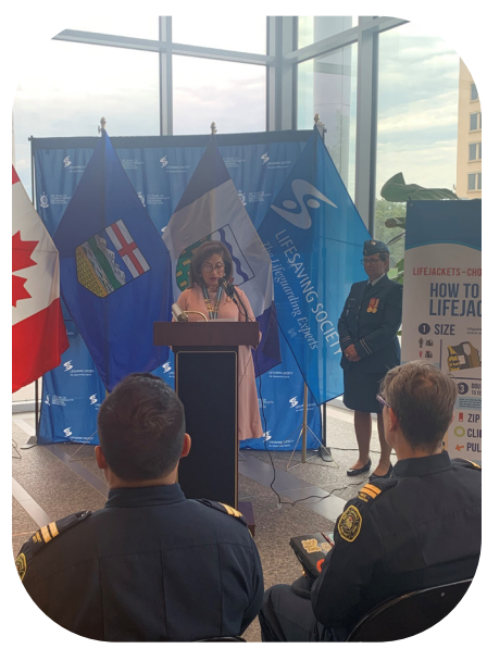
World Drowning Prevention Day Ceremony, Edmonton Alberta