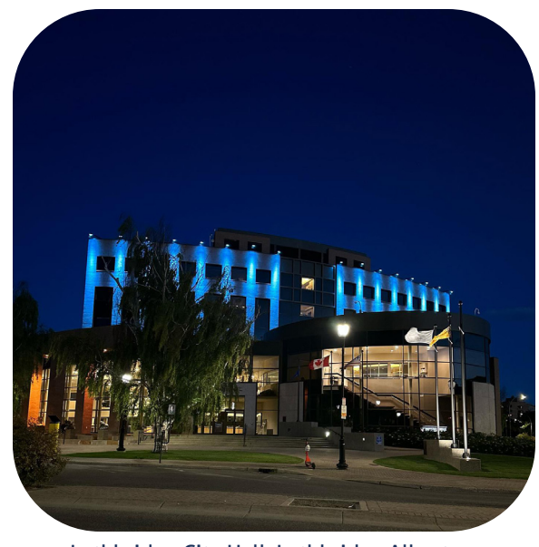
Lethbridge City Hall, Lethbridge Alberta