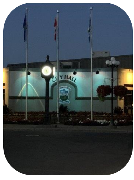
Brooks City Hall, Brooks Alberta