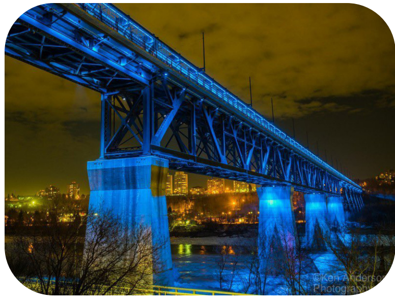
High Level Bridge, Edmonton Alberta