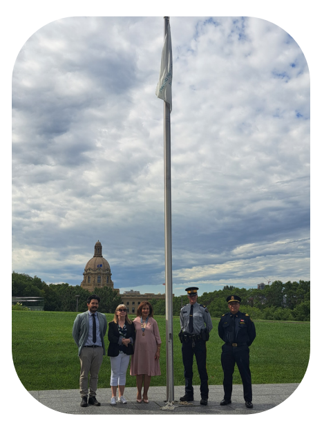
World Drowning Prevention Day Flag Raising,Edmonton Alberta