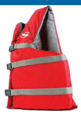
$37.63 (all sizes)