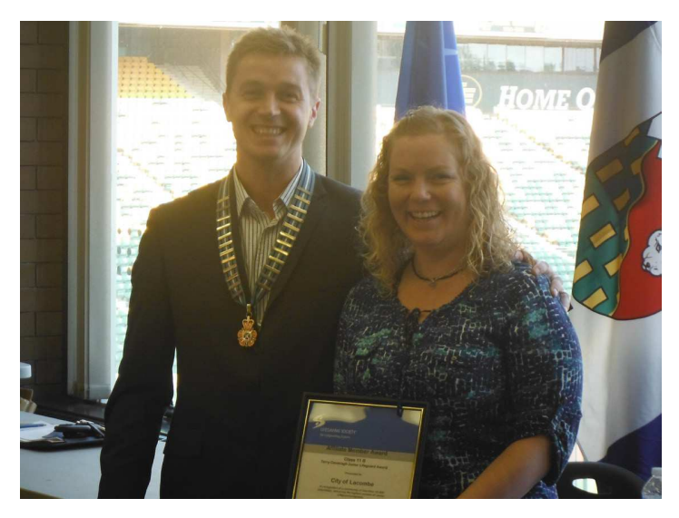
Photo taken at Annual General Meeting and Branch Awards June 21, 2013 at Commonwealth Stadium in Edmonton, AB.